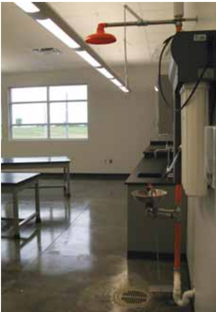
Emergency wash station in the Lager Plant & Energy Science building.