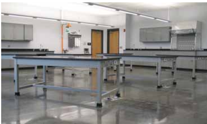
Lager Plant & Energy Science lab.