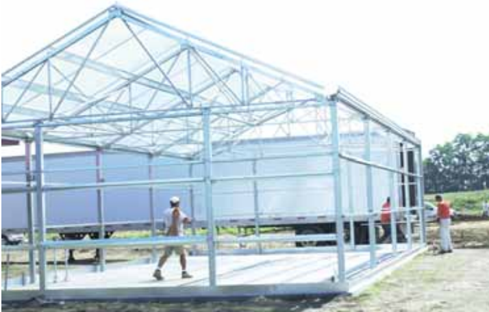
The Whan Family Greenhouse under construction just south of the Lager Laboratory.