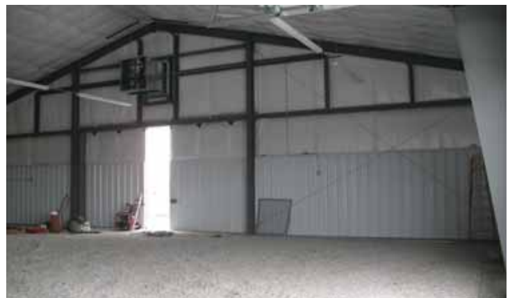
Heavy equipment storage area inside the Metcalf Mechanical Resource Center.