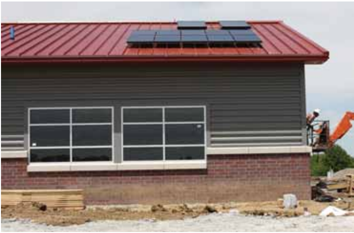
Solar panels on the Lager Plant & Energy Science building provide energy to heat water.