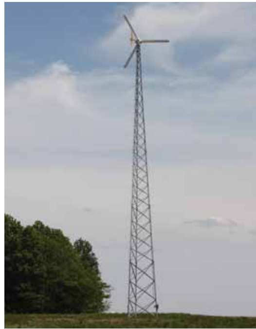
The wind turbine produces energy used to supplement the electricity used at the Barton Farm Campus.