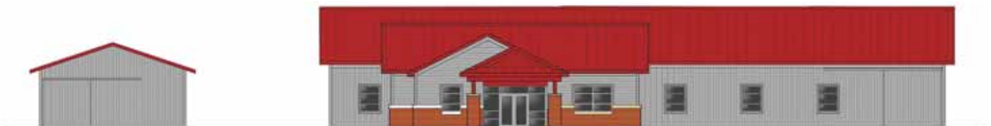
Future animal science facility, currently under construction.