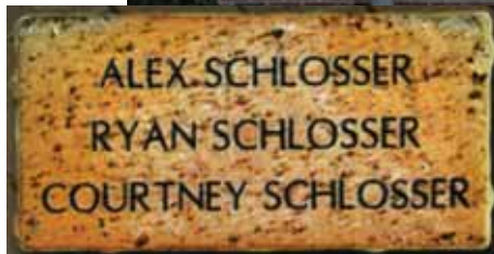
A sample commemorative brick.