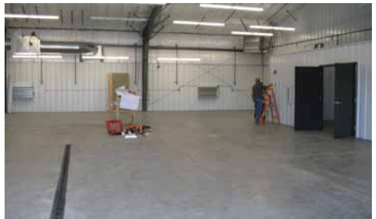
Ag mechanics lab near completion in the Metcalf Mechanical Resource Center.