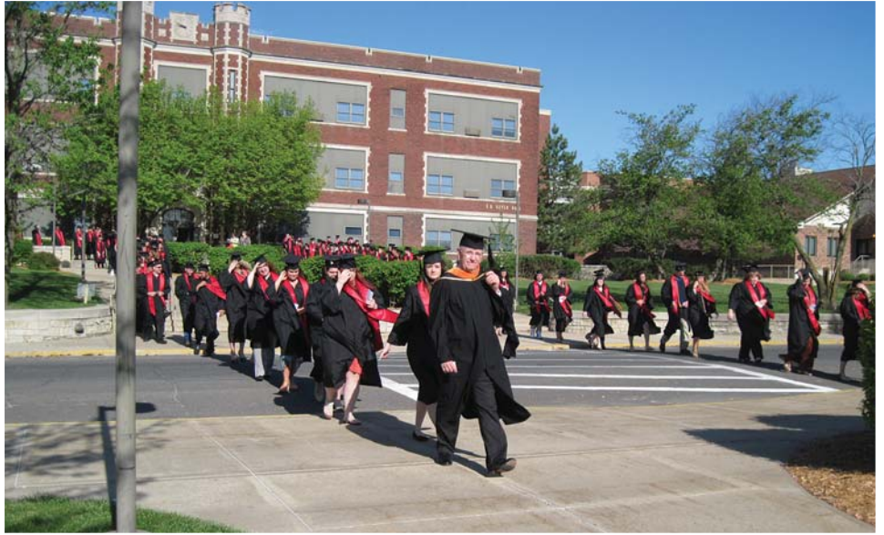
"The Walk" from Geyer Hall to Ketcham Community Center.

A list of graduates is available at www.ncmissouri.edu/news/Pages/LocalStudentsGraduateMay10.may12.aspx .