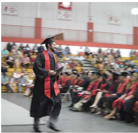
Another proud graduate.