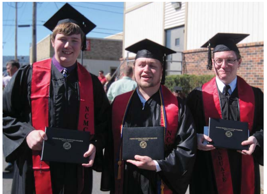
NCMC students proudly displaying their degrees.