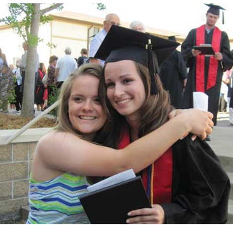
Hugs are everywhere on commencement day.