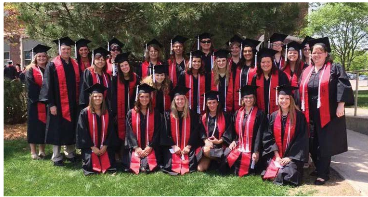
NCMC's Maryville nursing program graduates.