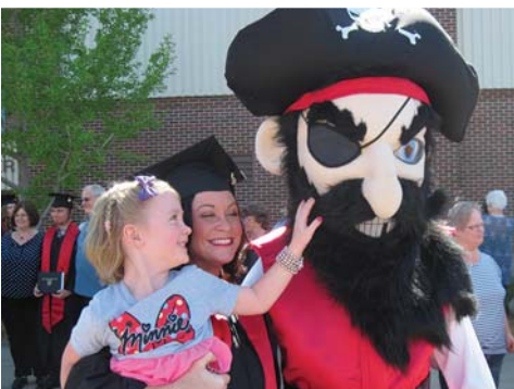
Cap'n Patch attends commencement.