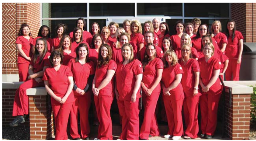
NCMC's Trenton nursing program graduates.