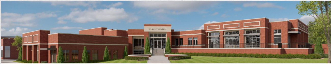
STUDENT CENTER - DINING HALL - BOOKSTORE