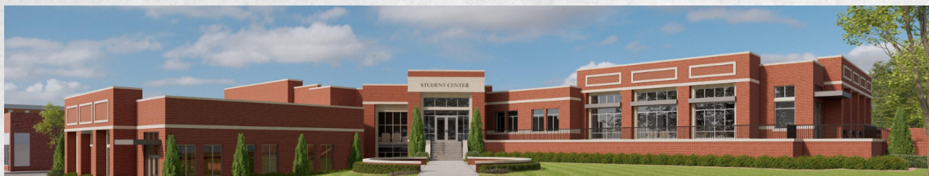
STUDENT CENTER - DINING HALL - BOOKSTORE

North Central Missouri College has a rich campus history. As the campus and student body continues to grow, so does the demand to enhance the collegiate feel of the campus and provide students with a place to congregate, build friendships, and provide educational opportunities outside of the classroom.