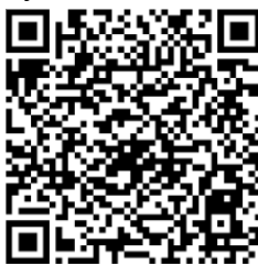
MS Student App